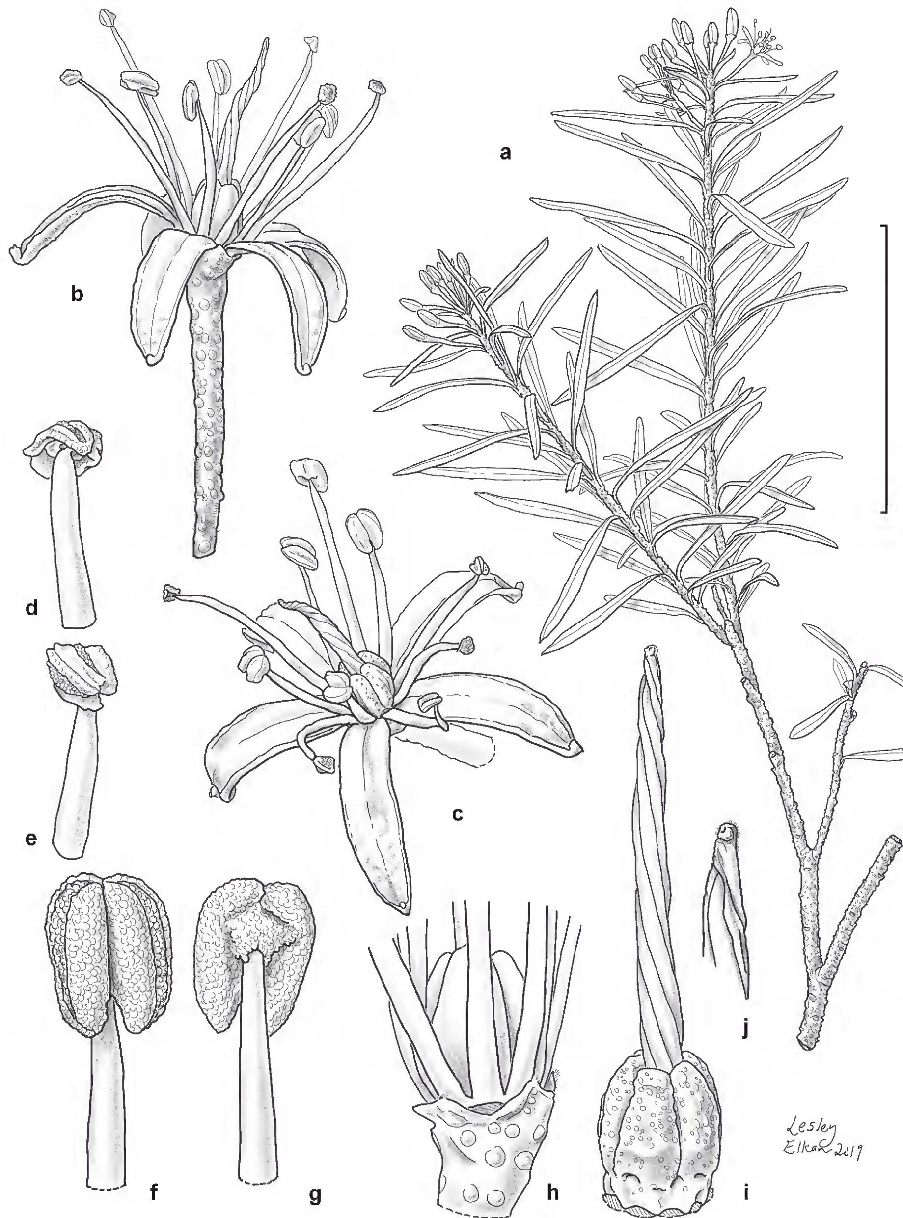
Fig. 1. Leionema praetermissum : a - habit; b – flower, side view; c – flower, \frac{3}{4} view; d - antesepalous anther, abaxial view; e - antesepalous anther, adaxial view; f - antepetalous anther, adaxial view; g - antepetalous anther, abaxial view; h - calyx, base of stamens and gynoecium detail; i - gynoecium; j - stigma detail. a-j - Weston 2432 & Rodd (NSW). Scale bar = 50 mm for a; 7.5 mm for b & c; 2 mm for d - g & j; 3.3 mm for h & i. Illustration: L. Elkan.